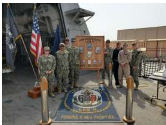
SSO's perform ship visit to USS SIOUX CITY (LCS 11) during her deployment to FIFTH Fleet for scheduled P-MAV

The Strategic Sealift Officers Force continues to be the most desired reservist community within C5F. When the world was shook by the events in Ukraine and the needs of the fleet shifting primarily to C6F and C7F for support, stability within C5F was more important than ever. The SSO community stepped up and provided the stability and continuity required, with a full return to normal operations outside of the pandemic. A prime example of this was provided by two SSO's on yearlong orders to Military Sealift Command Central (MSCCENT). These two SSO's directly organized, managed, and oversaw the success of 21 missions across 71 port visits within the CENTCOM AOR, supporting multiple entities, including, but not limited to: Defense